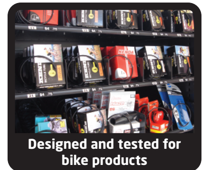
Designed and tested for bike products

Visit www.bikefixtation.com or call 612-568-3494 (USA) for more information