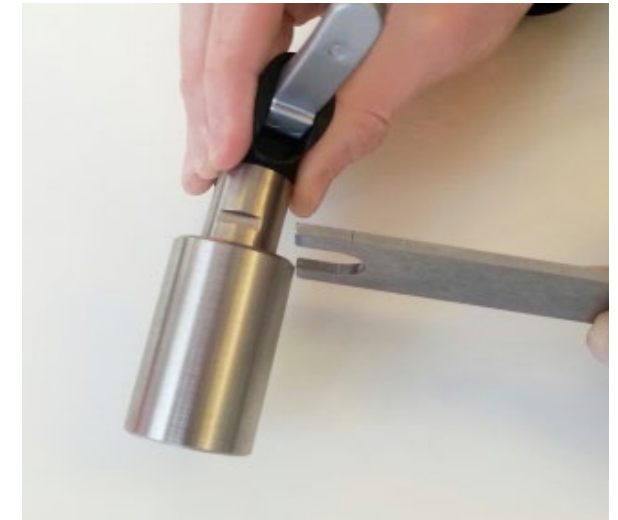
Step 2: Hold the pump head and fit spanner into the grooves.