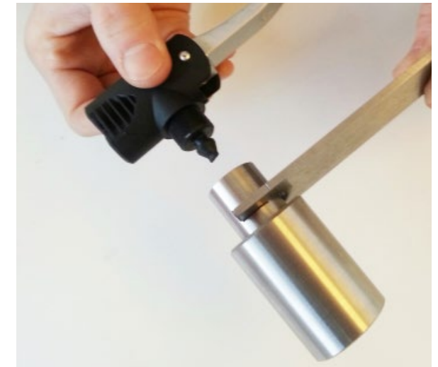
Step 4: Repeat the process the screw in the replacement pump head.