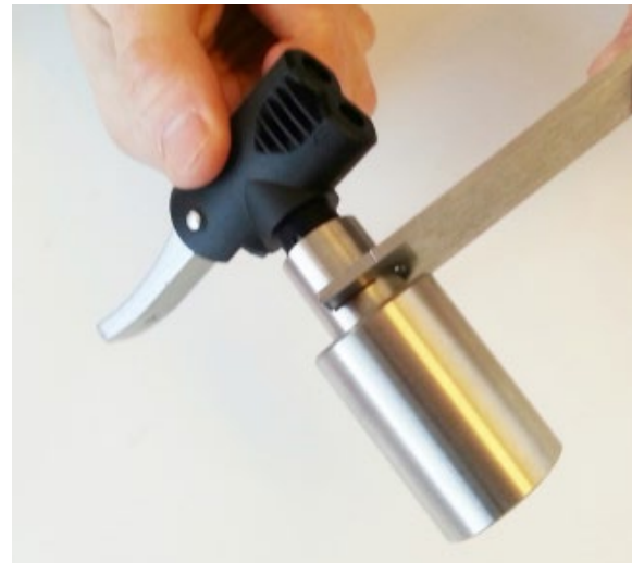
Step 3: Unscrew the pump head.