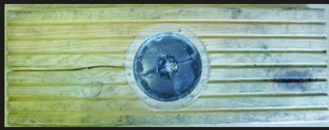
Figure 1 - Damage of SolarEye 80 product in decking following a compressive load of 600kN

Testing was undertaken on a Dennison 600kN tensile machine in order to determine the compressive strength. The SolarEye 80 product was loaded at increments of 20kN, between 20kN and 600kN, prior to being unloaded, checked and reloaded, in order to determine the point at which the light no longer functioned.